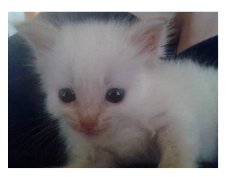
This kitten provided computer assistance.

We know that U.S. animal shelters in the most recent fiscal year appear to have killed about 77,250 fewer cats than in the year before, but we do not know whether fewer homeless cats were actually killed. This is because hard figures do not exist for the numbers of feral cats killed by nuisance wildlife trappers. Most states do not require nuisance wildlife trappers to report the numbers of cats they catch and kill.