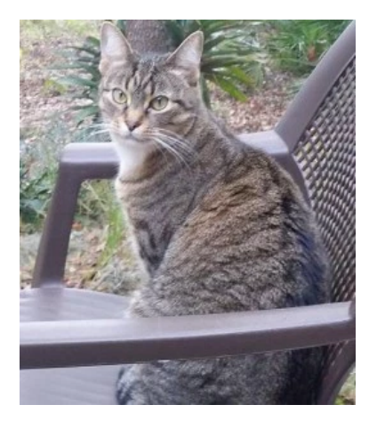
Bethie provided proofreading. (MC)

The number of real significance is the "Ratio," in other words; in instances where the human populations of jurisdictions have significantly changed, comparison of only the actual numbers of animals killed may be misleading.