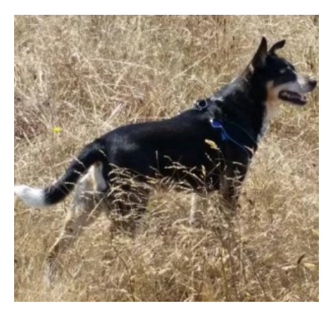
Bo provided technical advice. (BC)

Finally, readers familiar with current shelter jargon will note no reference to so-called "live release" or "save" rates. These are simply inversions of "euthanasia rate," the oldest and most misleading statistic ever devised to measure animal shelter performance.