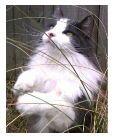
M the cat assisted in this data compilation.

Answering all of these questions will take time and more data.