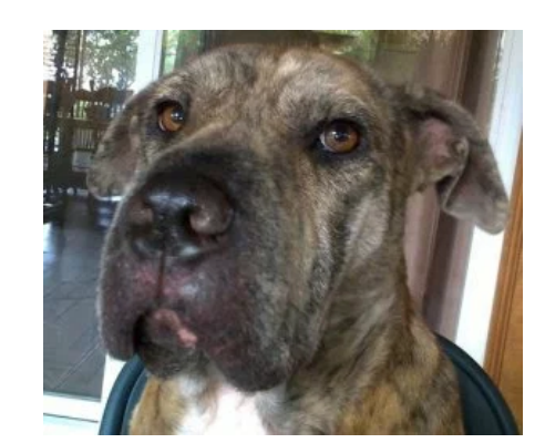
Rhonda the copy editor. (BC)

The exit data is compiled from the annual reports of every major open admission and animal control shelter serving each listed community, using only data from one or more of the three most recently