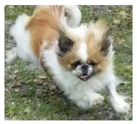
Max the numbers runner.

The attack data goes a long way toward explaining the mid-2013 discovery by the Best Friends Animal Society that younger people no longer regard shelters as the best places to find a dog.